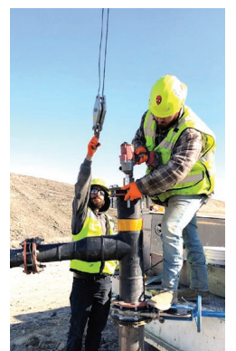
Well seal is secured.