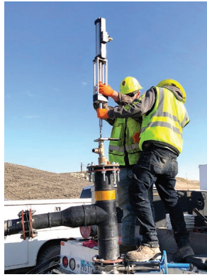
Top-head drive motor is attached.