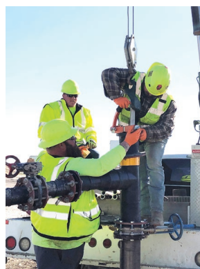
Final section, with well seal attached, is lowered.