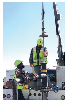
New pipe section is threaded onto secured drain coupling.