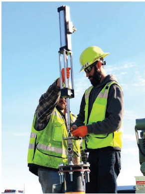
Piston Rod is connected to actuator rod. Insure rod does not slip into downhole.