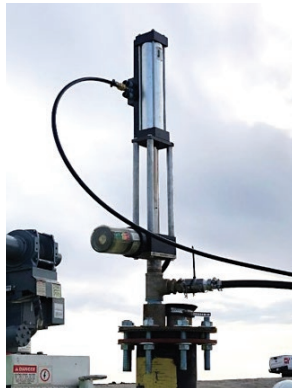
V-2 pneumatic piston pump is installed with 8-inch steel flanged gas-well seal.