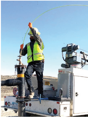
Drive piston and drive rod are installed.