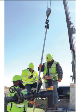
The pipe is lowered into the well casing.