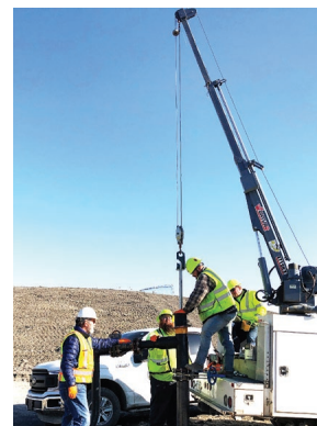
Pipe is clamped and secured on top of well casing.