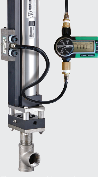
The programmable timer's extralarge dial and readout screen display the next scheduled cycle and cycle time remaining. The unit is designed to be leak proof.

BLACKHAWK TECHNOLOGY COMPANY | 21W211 HILL AVE. | GLEN ELLYN, IL 60137 | P 630.469.4916 | F 630.469.4896 www.blackhawkco.com | info@blackhawkco.com FactSheet5-Timer-9293 | 20170621 Page 1